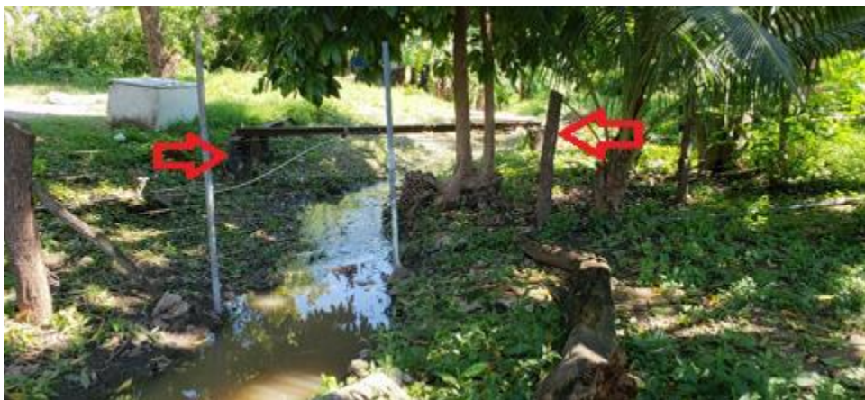
Fig 8: Abutment/Foundation and frame of driveway bridge that was excavated from the water channel