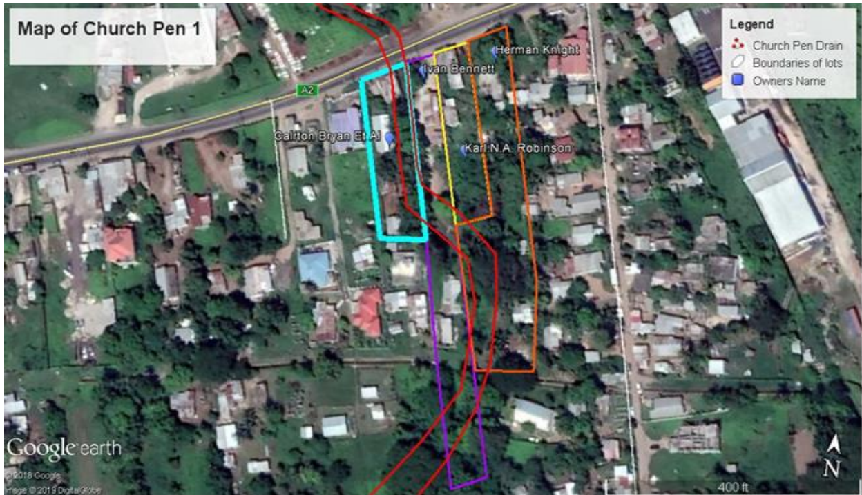
Fig 6: Location Map of Church Pen Drainage and the properties affected

The water channel naturally runs across three (3) properties. Initially works were concentrated on the Property of (name removed) (where the culvert is) however, due to design changes during implementation, two of the three parties were affected.