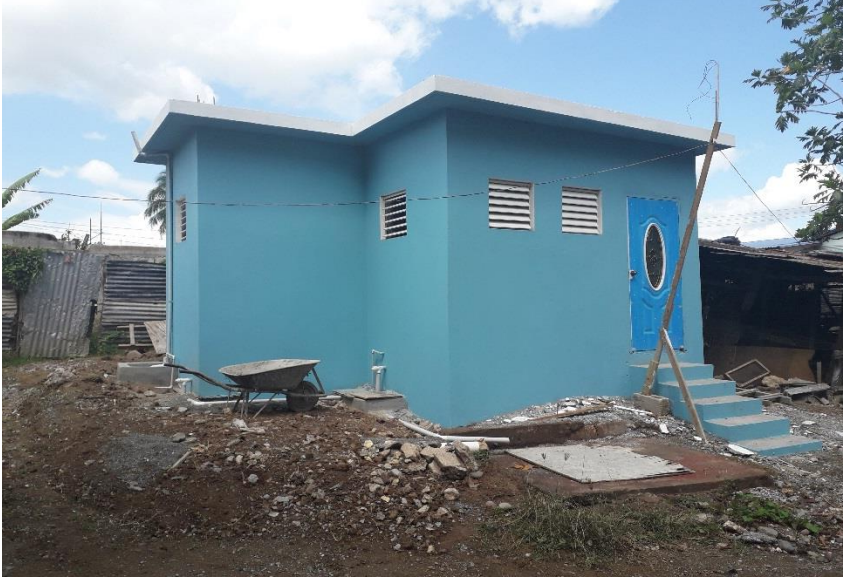
Fig 5: Newly constructed dwelling house