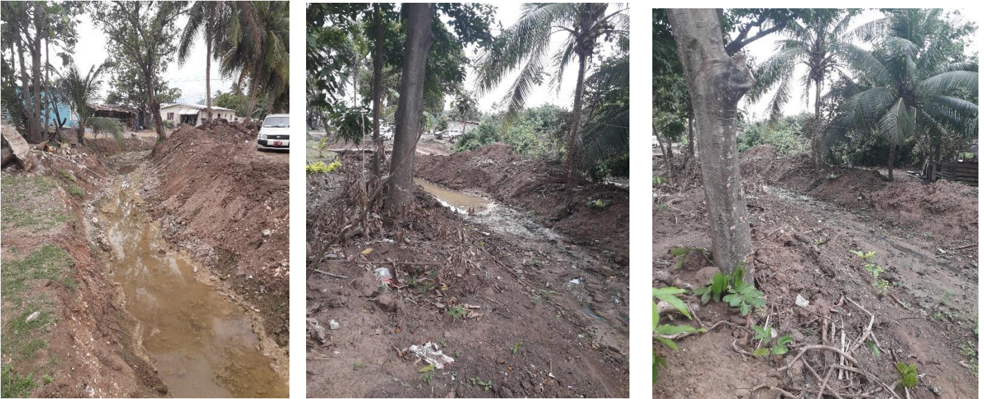
Fig 7: Widened drainage channel where fruit trees for were removed