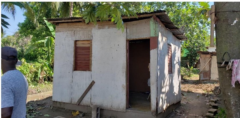
Fig 4: Dwelling house prior to demolition

The new structure is a 150mm block masonry construction with steel reinforced corner stiffeners and concrete slab roof. The house was handed over at practical completion to the occupant. Minor works will be completed within the next two to three weeks.