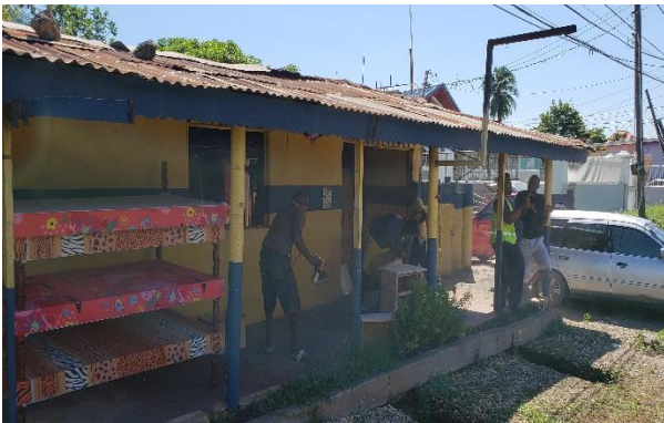
Fig2: Before Demolition

The Furniture shop was demolished in October 2018. PAPs were paid monies for the lost structure and three (3) months transition payment as salary prior to this. See annex 10 for documentation verifying payments.