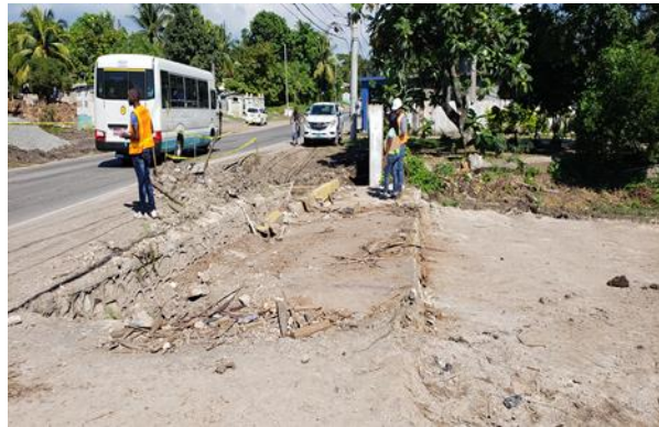
Fig3: Post Demolition