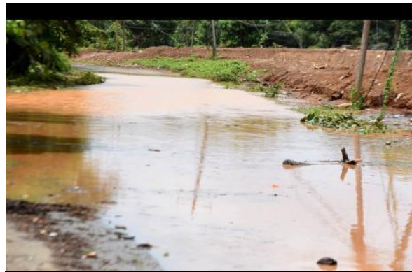
The Main Road through Big Pond Flooded by heavy rains after Tropical Storm Elsa caused the Pond to overflow.