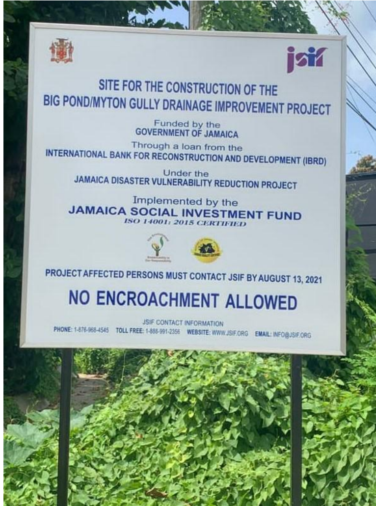
Figure 3: Project Sign with Cut-off Date

The sign above was used to ensure consistent information is being communicated to all affected persons. Additionally, the sign provided detailed contact information for persons who wish to contact JSIF directly.