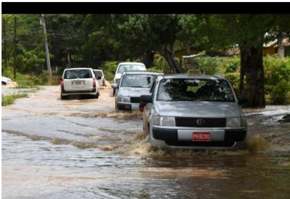
Taxi operators and private passenger vehicles navigating the flooded streets in the Big Pond community.

The Big Pond area was in the past also emptied by an earthen drain which discharged into the Myton Gully. According to anecdotal information and media reports 3 , the constant build-up (dumping) of the drainage passage to facilitate construction of residential buildings and access roads has severely obstructed this waterway. Consequently, the area has become more susceptible to flooding, especially during major storms.