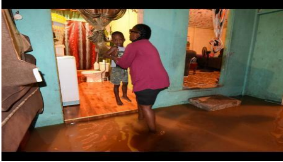
Resident in Bannister lifts her son to safety inside her home that was flooded during Tropical Storm Grace.