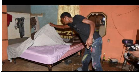
Resident shows how his home has been flooded due to the heavy rains caused by Tropical Storm Elsa.

The solution is to reinstate the major drain to Myton Gully which would necessitate the improvement of the Myton Gully course from Bannister to the bridge on the Old Harbour main road. (The length of the course from Bannister to Old Harbour Bay is approximately 10 kilometres). The Myton Gully drainage in Old Harbour, St. Catherine has been appraised for drainage improvement works under the JDVRP project. Another consideration is that Old Harbour is the fastest growing community with residential and commercial lots transformed into multiple housing developments and business complexes over the last decade. Such rapid development has also placed demands on the limited drainage infrastructure which now requires an upgrade. Overall, the Myton Gully to Frazer’s Gully channel spans across multiple housing schemes in Bannister, Claremont, Old Harbour Glades, Marlie Acres, Old Harbour Villas and New Harbour Village.